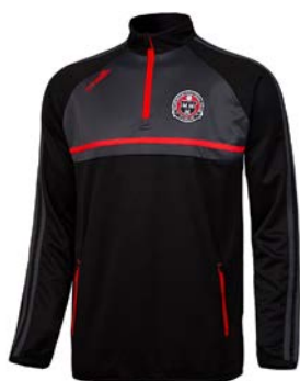
BOHEMIAN FC MASON HALF ZIP SQUAD TOP

Design Your Own gear – leadtime increases to 6-8 weeks with minimum order requirements (please check with your point of contact).