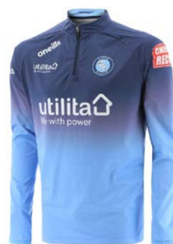
WYCOMBE SUBLIMATED SHORT ZIP TOP