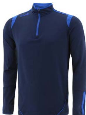
HZ SQUAD TOP