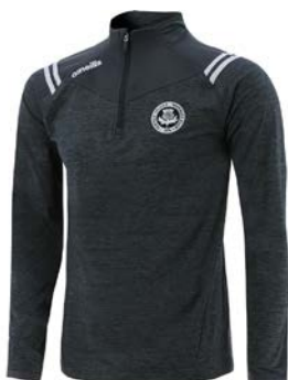
PARTICK THISTLE COLORADO HALF ZIP BRUSH TOP