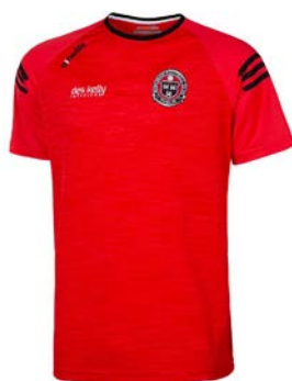
BOHEMIAN FC MEN'S VOYAGER T-SHIRT